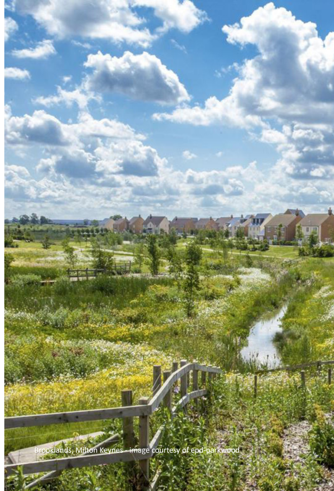
Brooklands, Milton Keynes

For the EQRP to succeed, it must be carried out using a robust, yet transparent and collaborative process. It must also offer consistently high standards in the quality of its advice. These standards can be summarised in the key eleven principles.