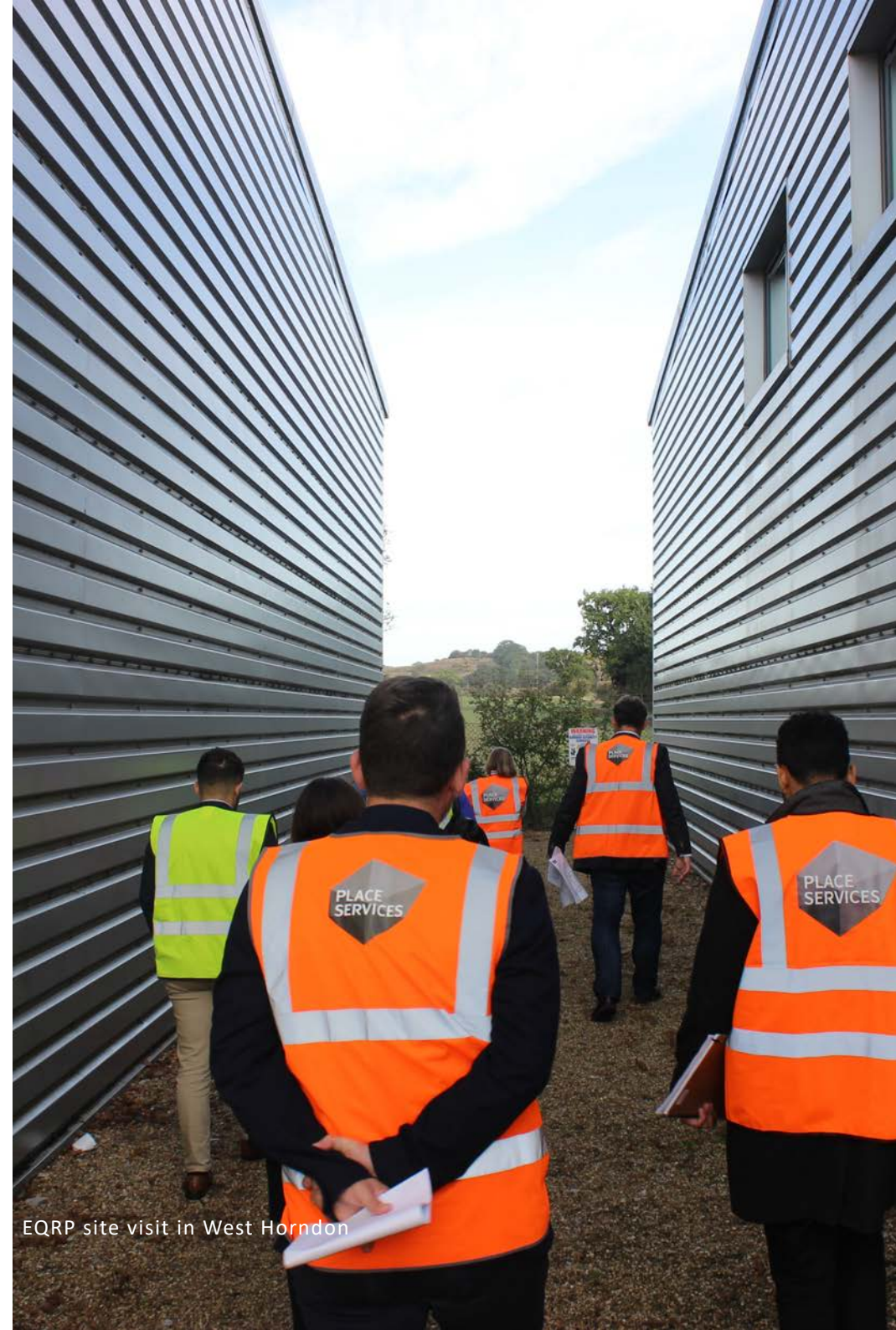
EQRP site visit in West Horndon

All pre-information packs and presentation documents would be required to be submitted 5 working days prior to the Quality Review Panel. Submitting the documents would be issued via the Panel Manager, who would distribute to the Chair and Members selected for the panel. It is requested that documents are issued electronically in a suitable format (typically PDF).