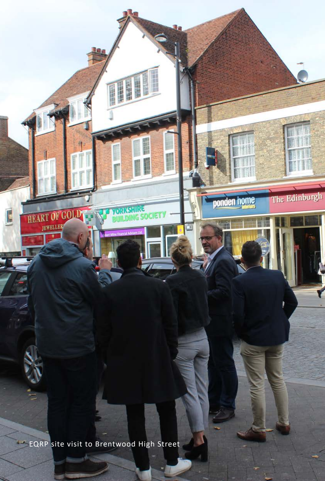
EQRP site visit to Brentwood High Street