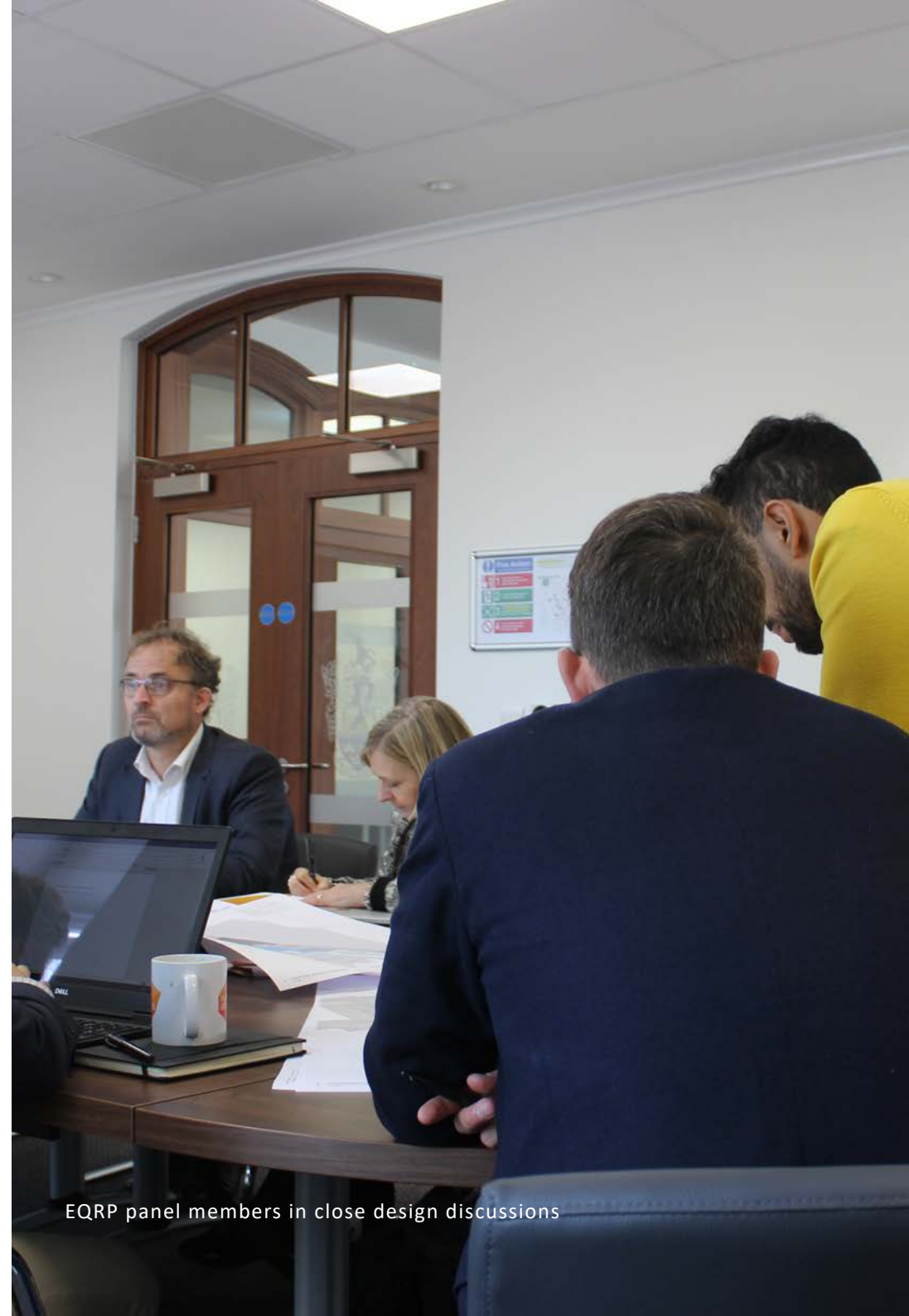
EQRP panel members in close design discussions

The Panel management team are happy to discuss applications to assess the need and value a Quality Review Panel would bring to your scheme.