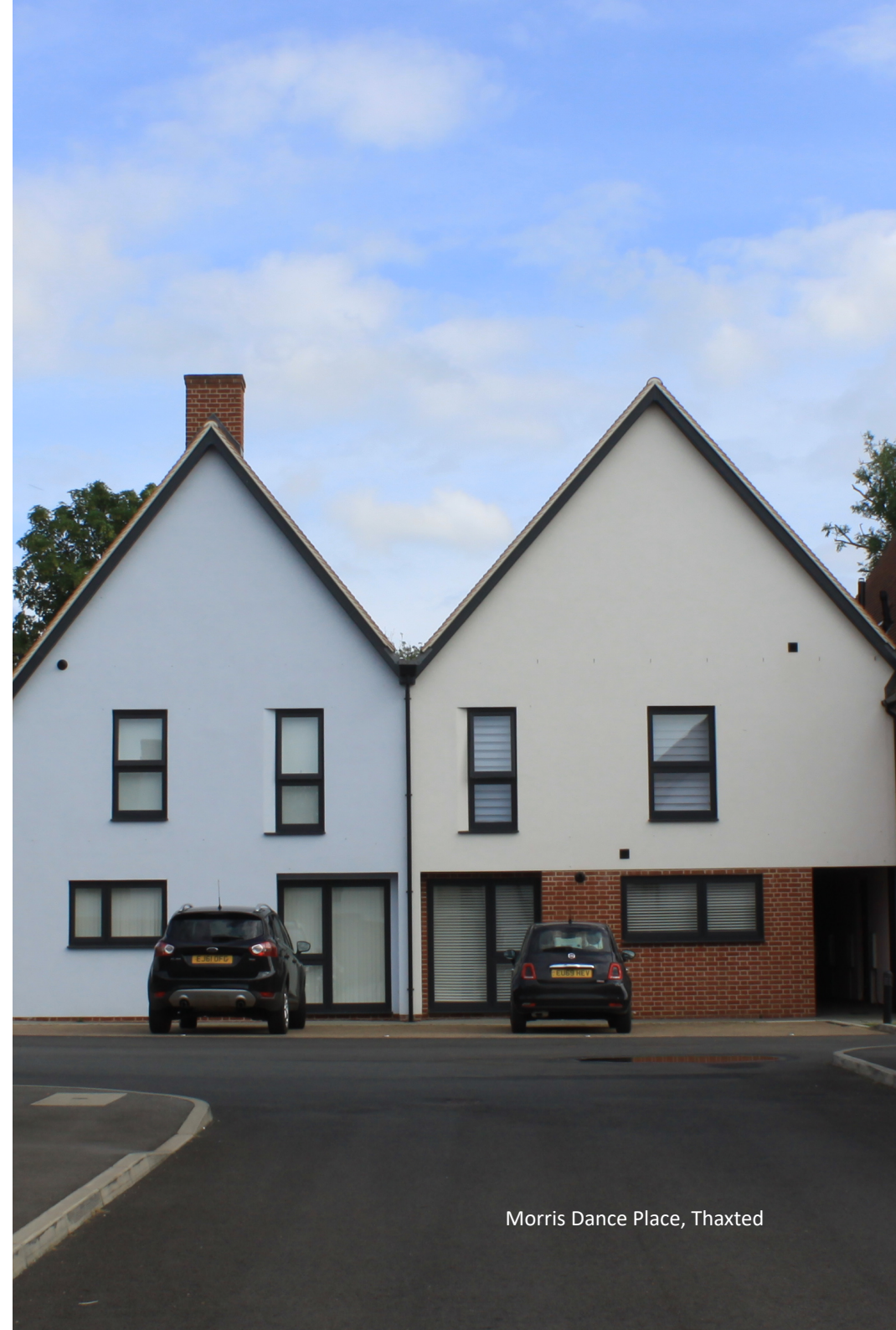
Morris Dance Place, Thaxted

All pre-information packs and presentation documents would be required to be submitted 5 working days prior to the Quality Review Panel. Submitting the documents would be issued via the Panel Manager, who would distribute to the Chair and Members selected for the panel. It is requested that documents are issued electronically in a suitable format (typically PDF).