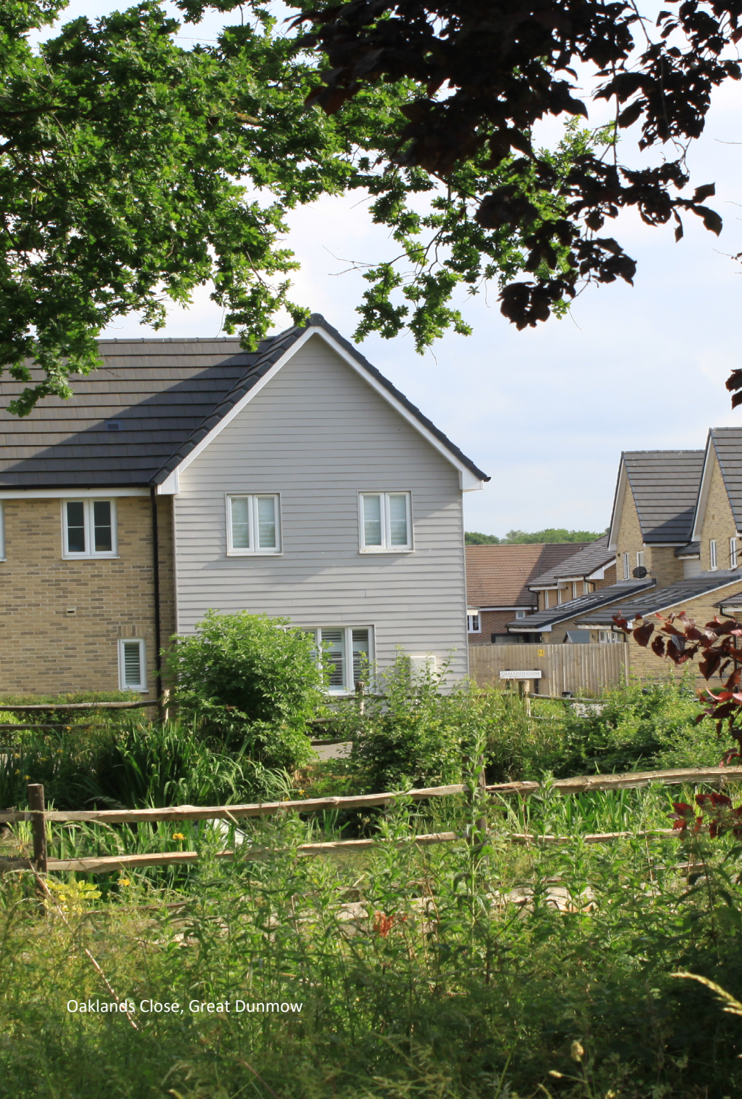
Oaklands Close, Great Dunmow