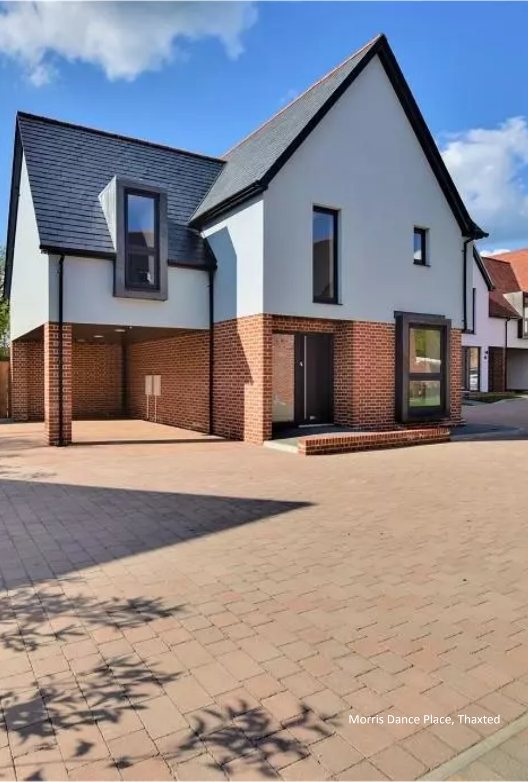
Morris Dance Place, Thaxted