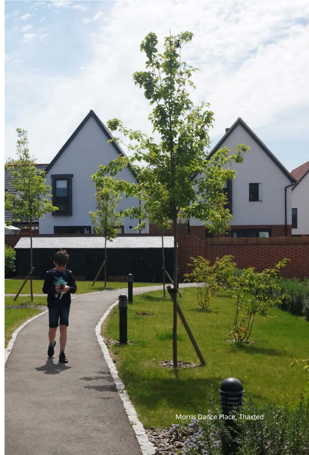
Morris Dance Place, Thaxted

Where a conflict of interest is raised and declared, it will be asked that the panel member is to step down from a review. Where a declaration of interest may be sufficient it will be requested a panel member are to contact the panel manager to discuss.