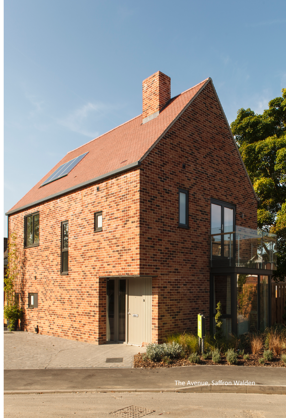
The Avenue, Saffron Walden

“133. Local planning authorities should ensure that they have access to, and make appropriate use of, tools and processes for assessing and improving the design of development. These include workshops to engage the local community, design advice and review arrangements, and assessment frameworks such as Building for a Healthy Life 51 . These are of most benefit if used as early as possible in the evolution of schemes, and are particularly important for significant projects such as large scale housing and mixed use developments. In assessing applications, local planning authorities should have regard to the outcome from these processes, including any recommendations made by design review panels.”