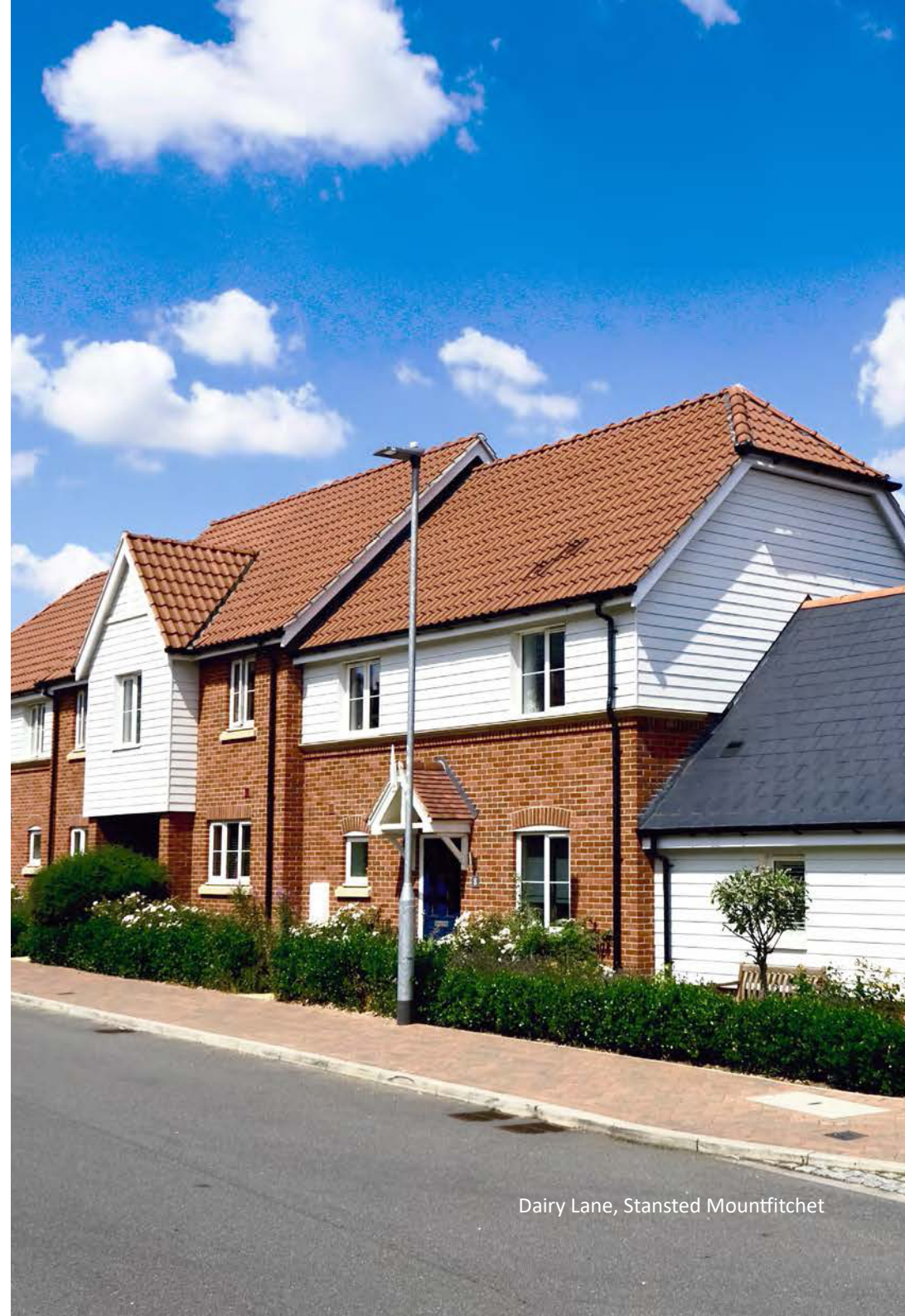
Dairy Lane, Stansted Mountfitchet

For the UQRP to succeed, it must be carried out using a robust, yet transparent and collaborative process. It must also offer consistently high standards in the quality of its advice. These standards can be summarised in the key eleven principles.