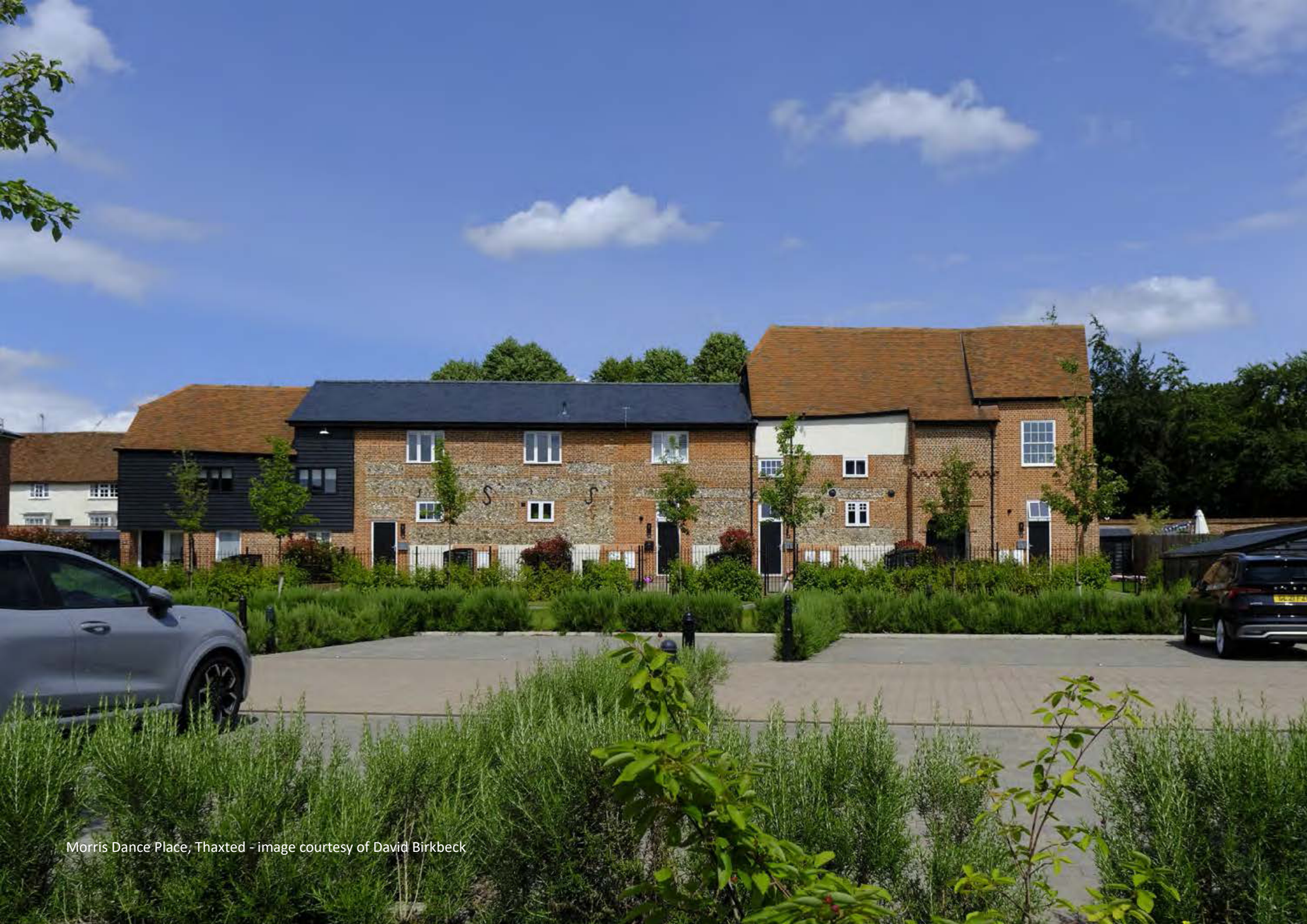
Morris Dance Place, Thaxted