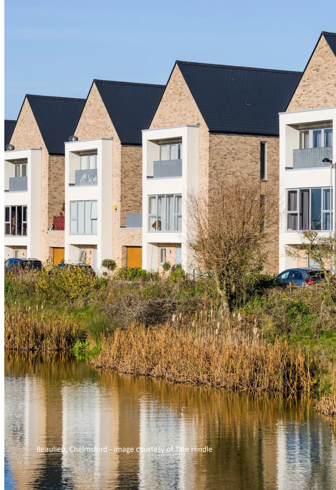
Beaulieu, Chelmsford

For the EQRP to succeed, it must be carried out using a robust, yet transparent and collaborative process. It must also offer consistently high standards in the quality of its advice. These standards can be summarised in the key eleven principles.