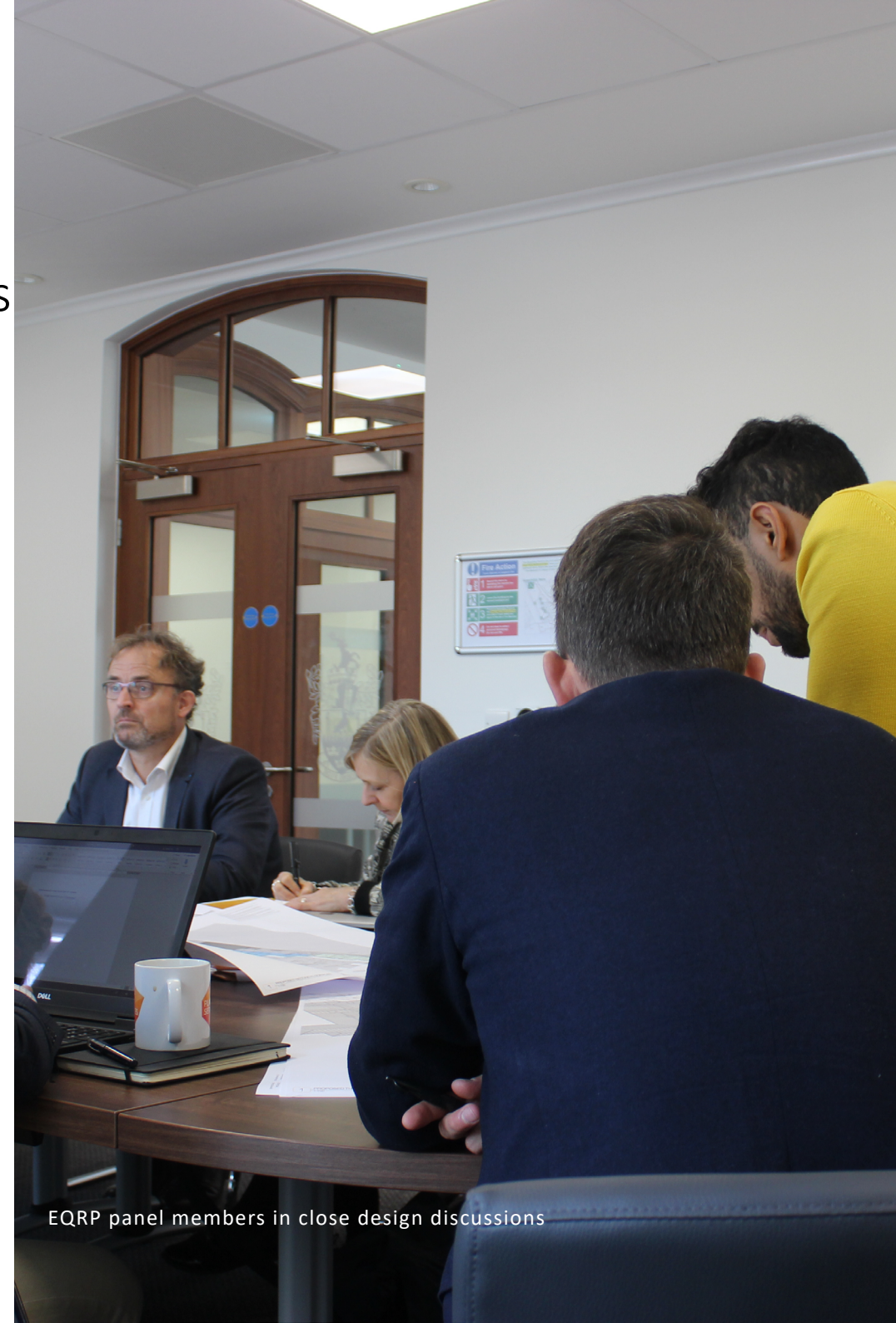
EQR panel members in close design discussions

The Panel management team are happy to discuss applications to assess the need and value a Quality Review Panel would bring to your scheme.