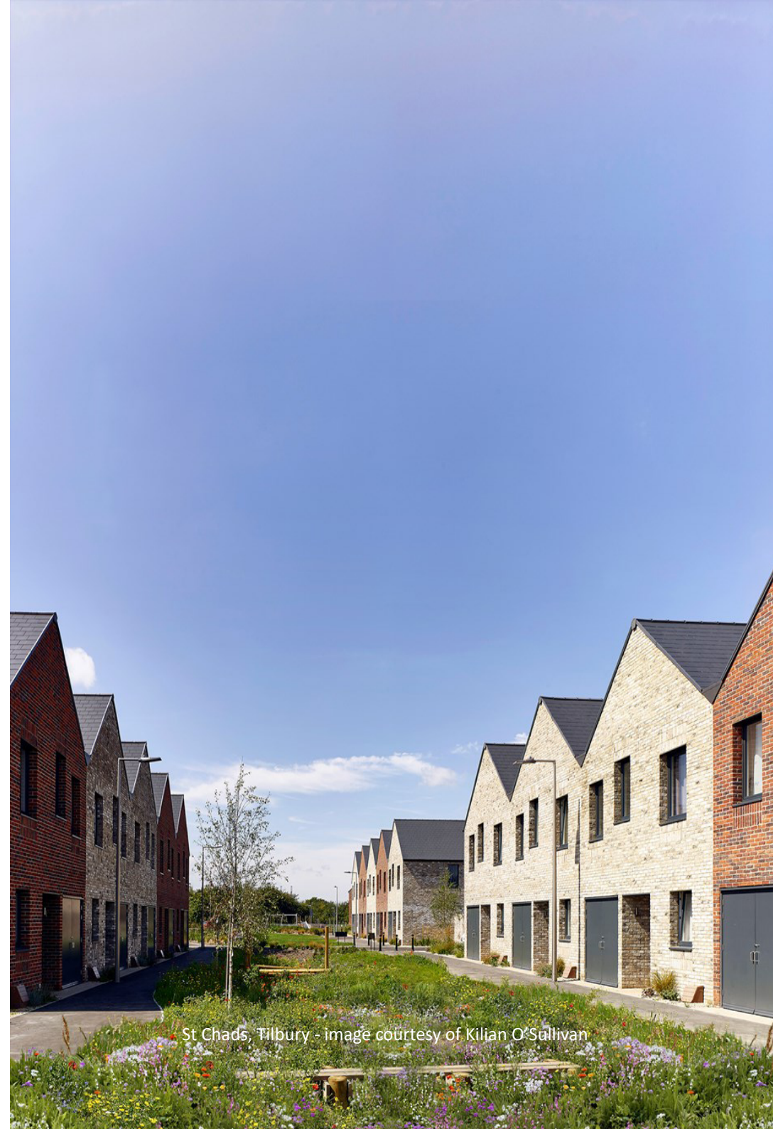
St Chads, Tilbury

“133. Local planning authorities should ensure that they have access to, and make appropriate use of, tools and processes for assessing and improving the design of development. These include workshops to engage the local community, design advice and review arrangements, and assessment frameworks such as Building for a Healthy Life 51 . These are of most benefit if used as early as possible in the evolution of schemes, and are particularly important for significant projects such as large scale housing and mixed use developments. In assessing applications, local planning authorities should have regard to the outcome from these processes, including any recommendations made by design review panels.”