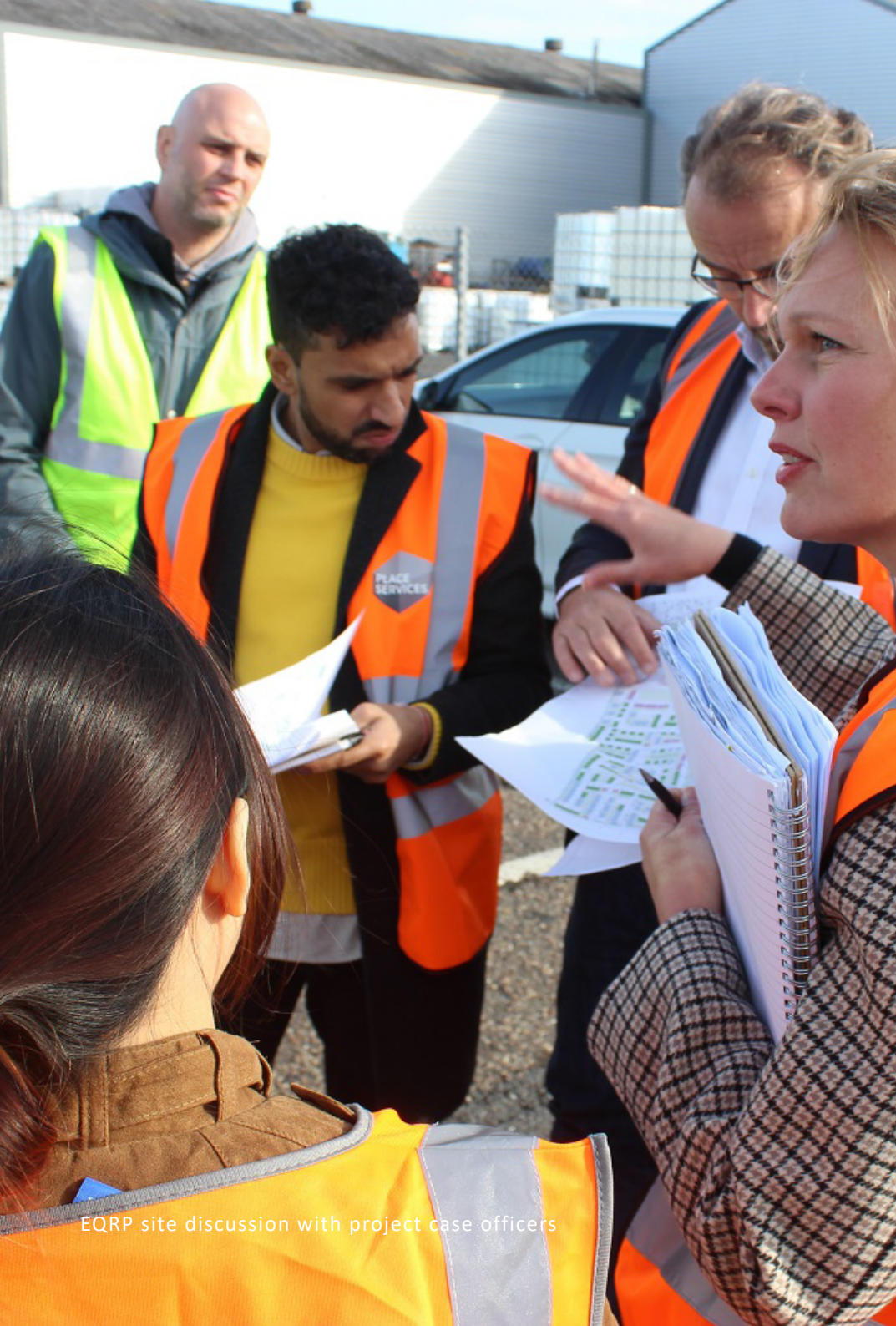
EQRP site discussion with project case officers