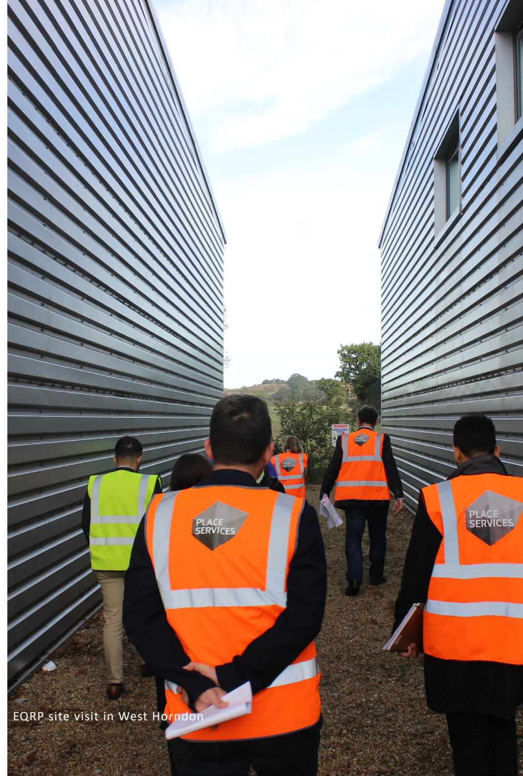
EQRP site visit in West Horndon

All pre-information packs and presentation documents would be required to be submitted 5 working days prior to the Quality Review Panel. Submitting the documents would be issued via the Panel Manager, who would distribute to the Chair and Members selected for the panel. It is requested that documents are issued electronically in a suitable format (typically PDF).