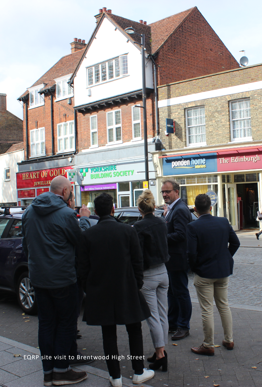
EQRP site visit to Brentwood High Street