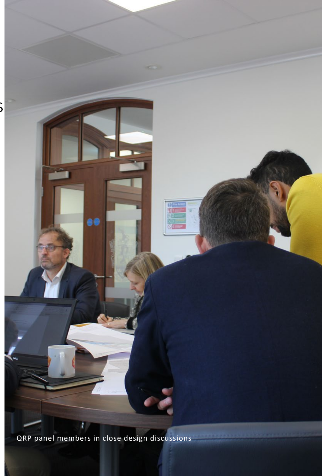
QRP panel members in close design discussions

The Panel management team are happy to discuss applications to assess the need and value a Quality Review Panel would bring to your scheme.