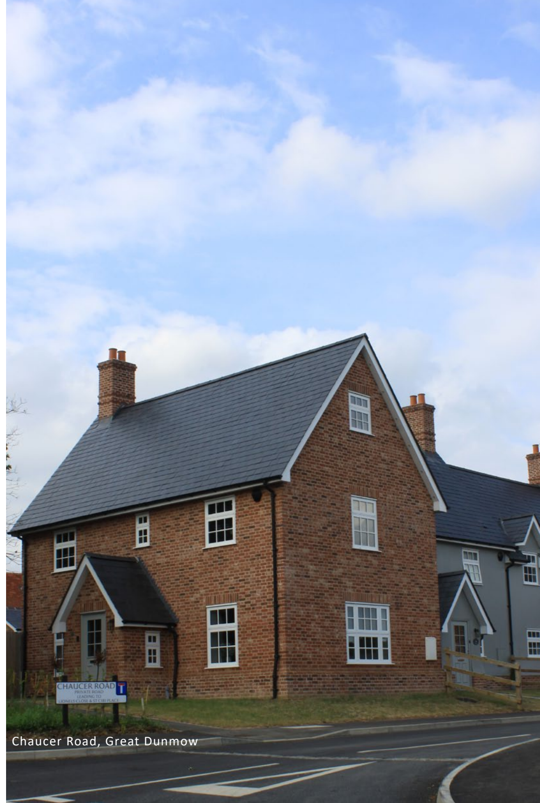
Chaucer Road, Great Dunmow

A briefing report template will be issued to the case officer via the Panel Manager or Coordinator, which will contain topic headings, such as; planning context, description of project, and stage of application. These headings will guide the officer to provide the required background information to the panel members, along with continued support from the UQRP admin team.