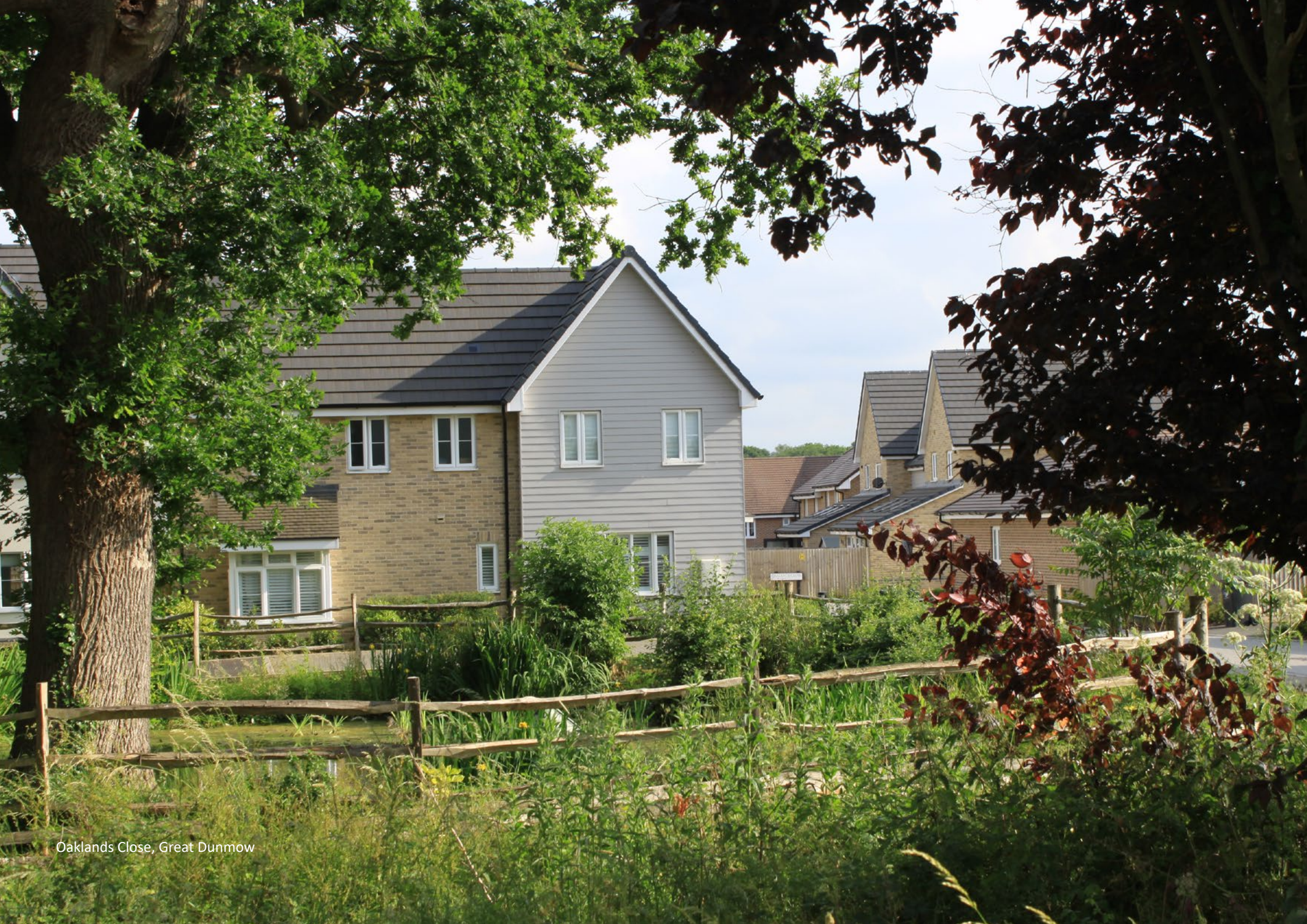
Oaklands Close, Great Dunmow