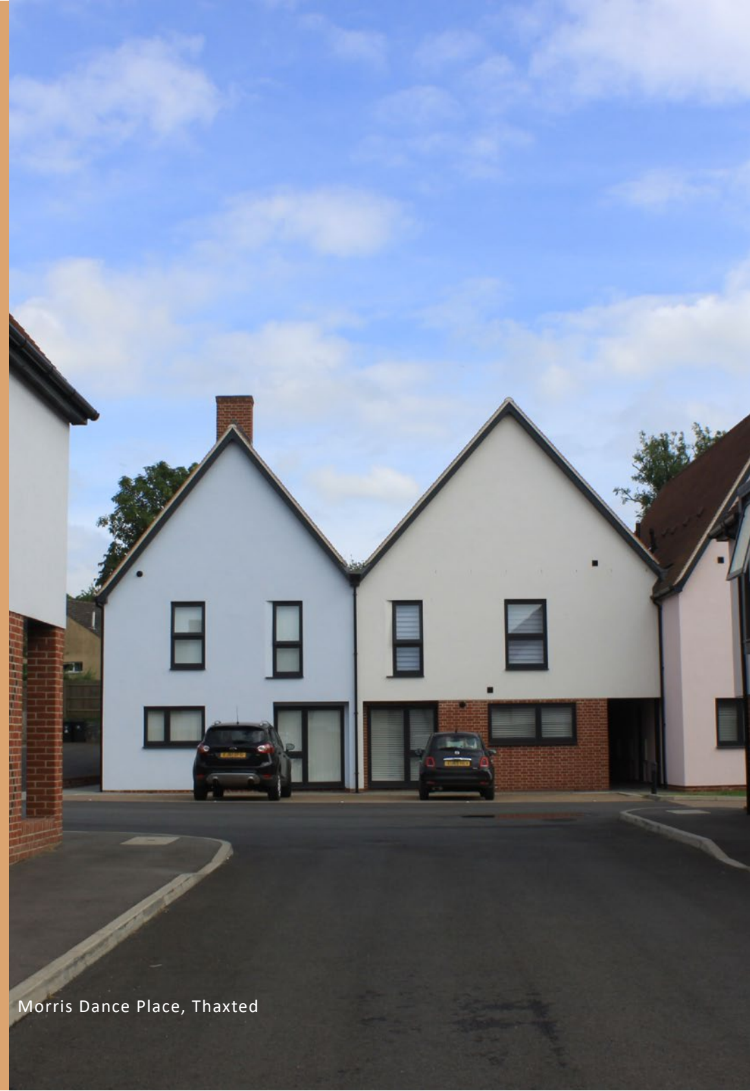
Morris Dance Place, Thaxted

During the formal review session, the LPA case officer will be asked by the Chair to provide a short presentation to further explain the planning and policy context of the project proposal, and what they will be looking for from the review. Therefore we recommend the planning officer completes a Powerpoint format proforma (example on the previous page) to allow a concise presentation with bullet points on the screen. This should take no more than 10 minutes. Following on from this, there will be a short Q+A session with the panel members to address any queries or clarifications regarding the information provided within the briefing report or case officer's presentation. The panel is open in allowing additional input for other consultees from the LPA to outline specialist concerns if required.