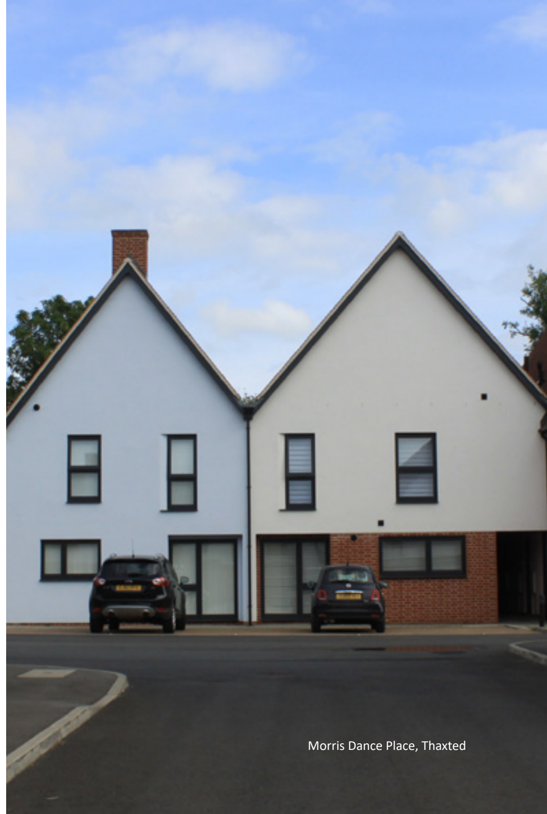
Morris Dance Place, Thaxted

All pre-information packs and presentation documents would be required to be submitted 7 working-days prior to the Quality Review Panel. Submitting the documents would be issued via the Panel Manager, who would distribute to the Chair and Members selected for the panel. It is requested that documents are issued electronically in a suitable format (typically PDF).