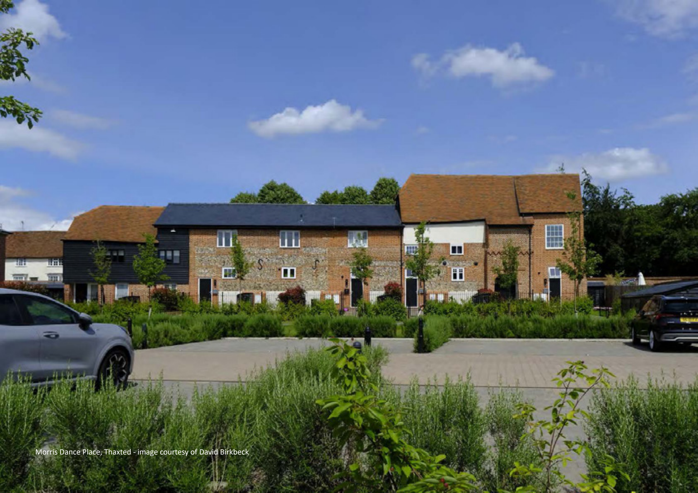
Morris Dance Place, Thaxted