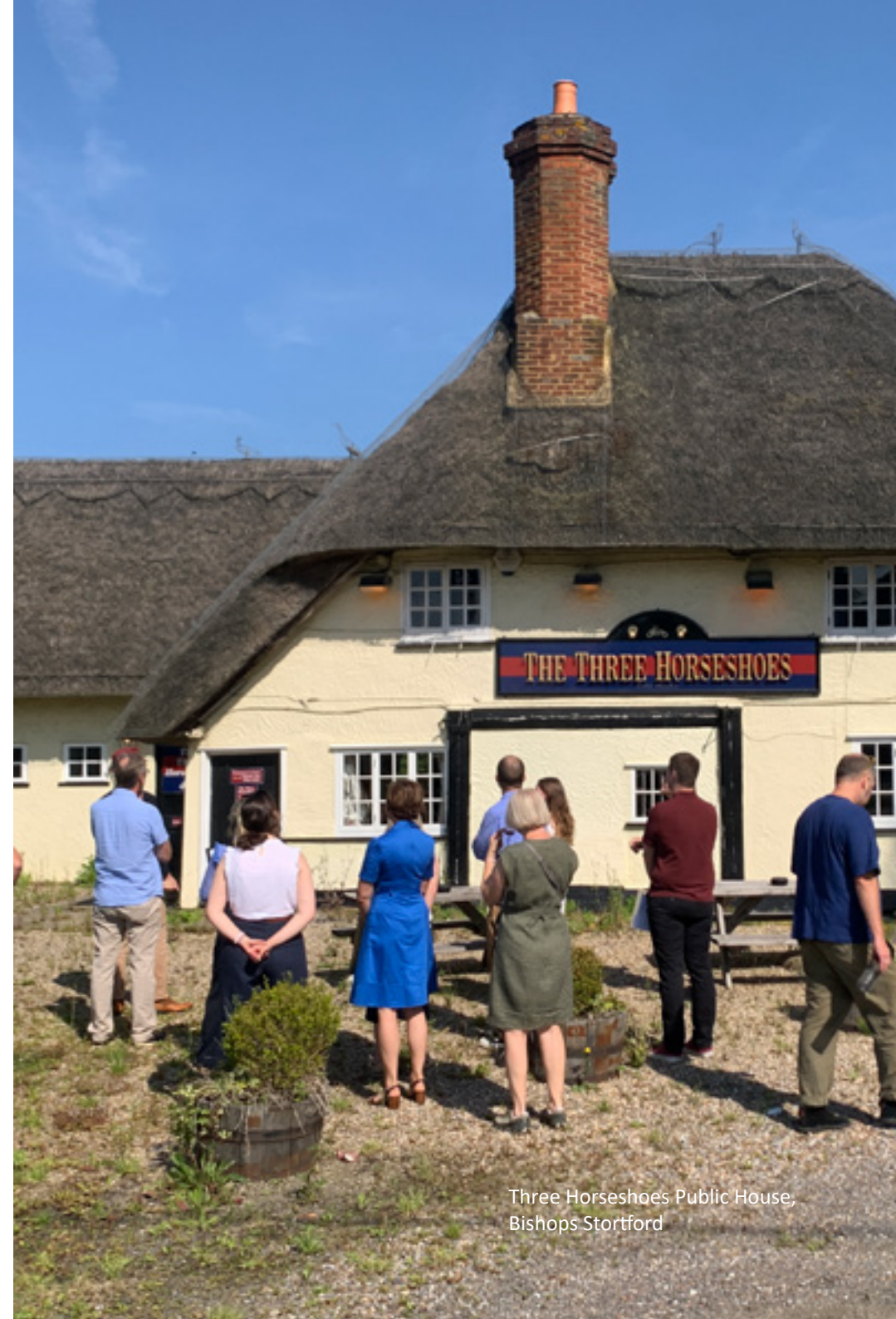
Three Horseshoes Public House, Bishops Stortford

Where a conflict of interest is raised and declared, it will be asked that the panel member is to step down from a review. Where a declaration of interest may be sufficient it will be requested a panel member are to contact the panel manager to discuss.