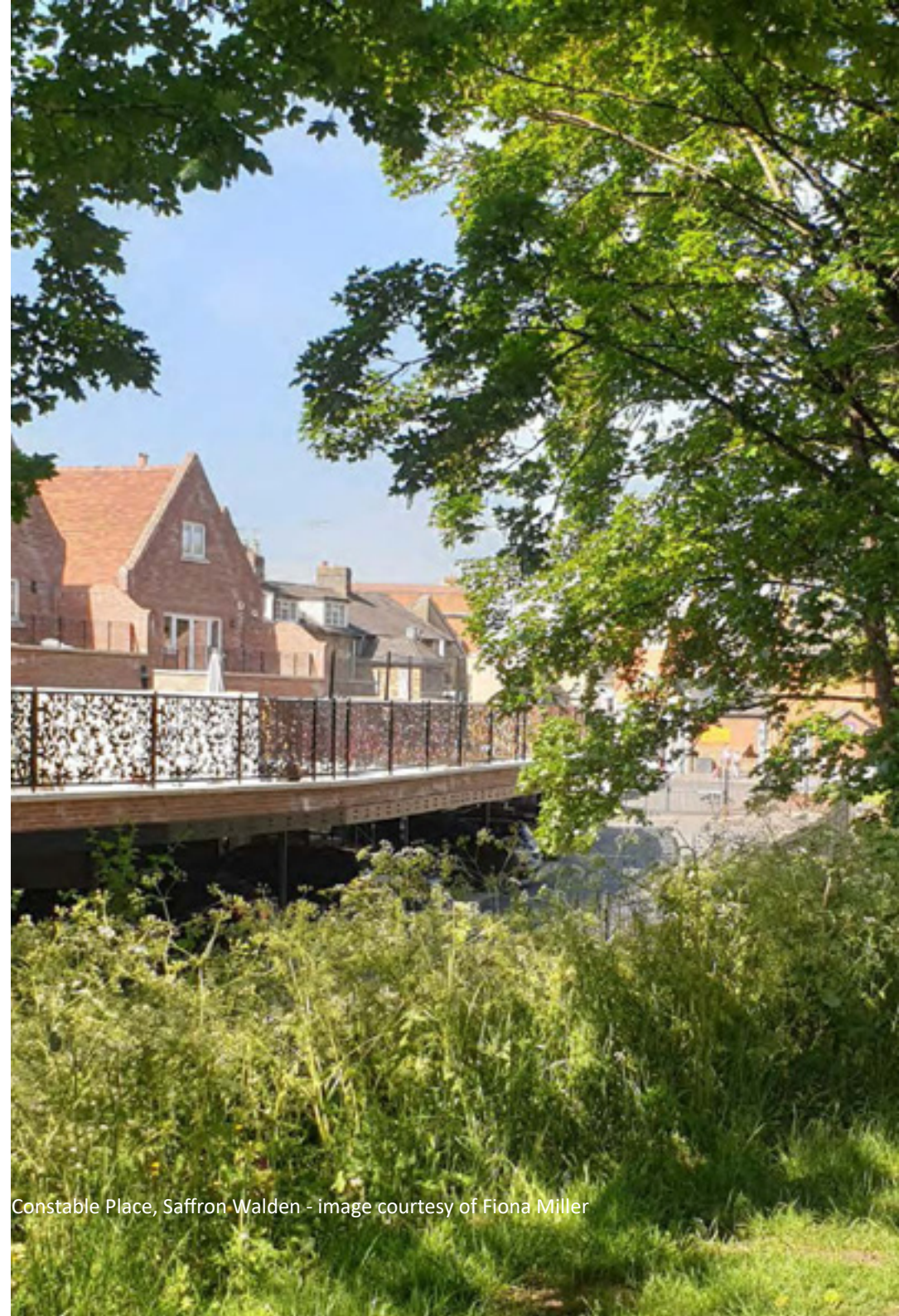
Constable Place, Saffron Walden

A Quality Review Panel provides a well-established method of offering independent and impartial guidance on the design of new buildings, landscapes, and public space.