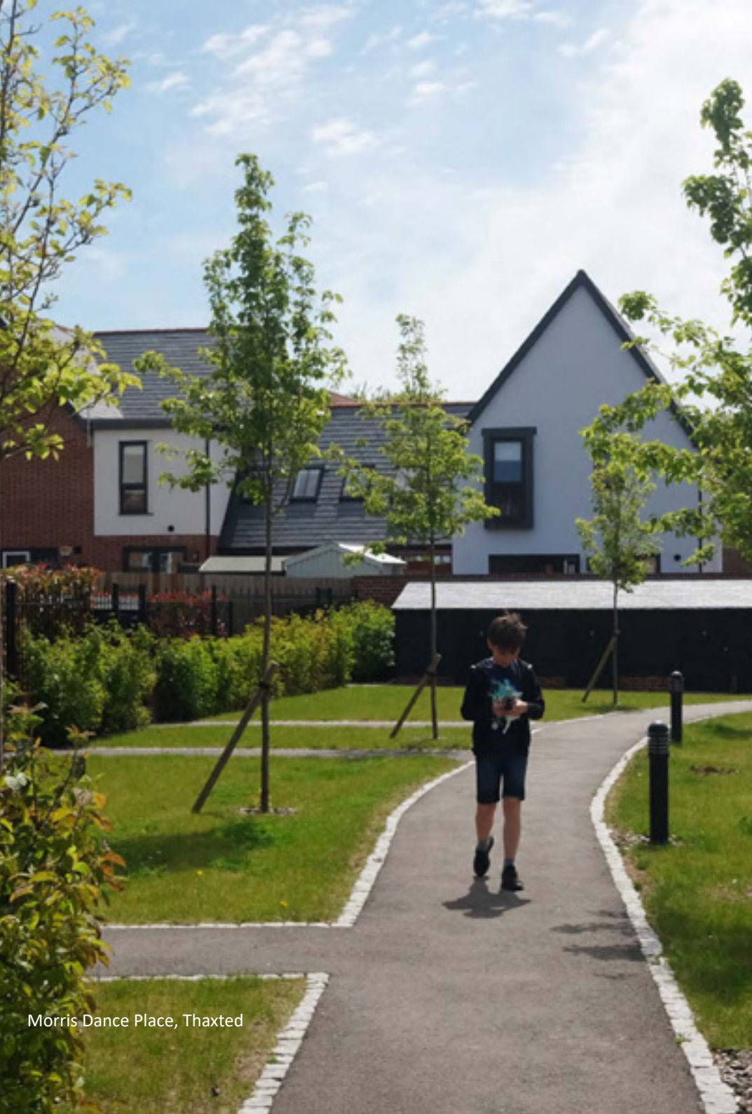
Morris Dance Place, Thaxted