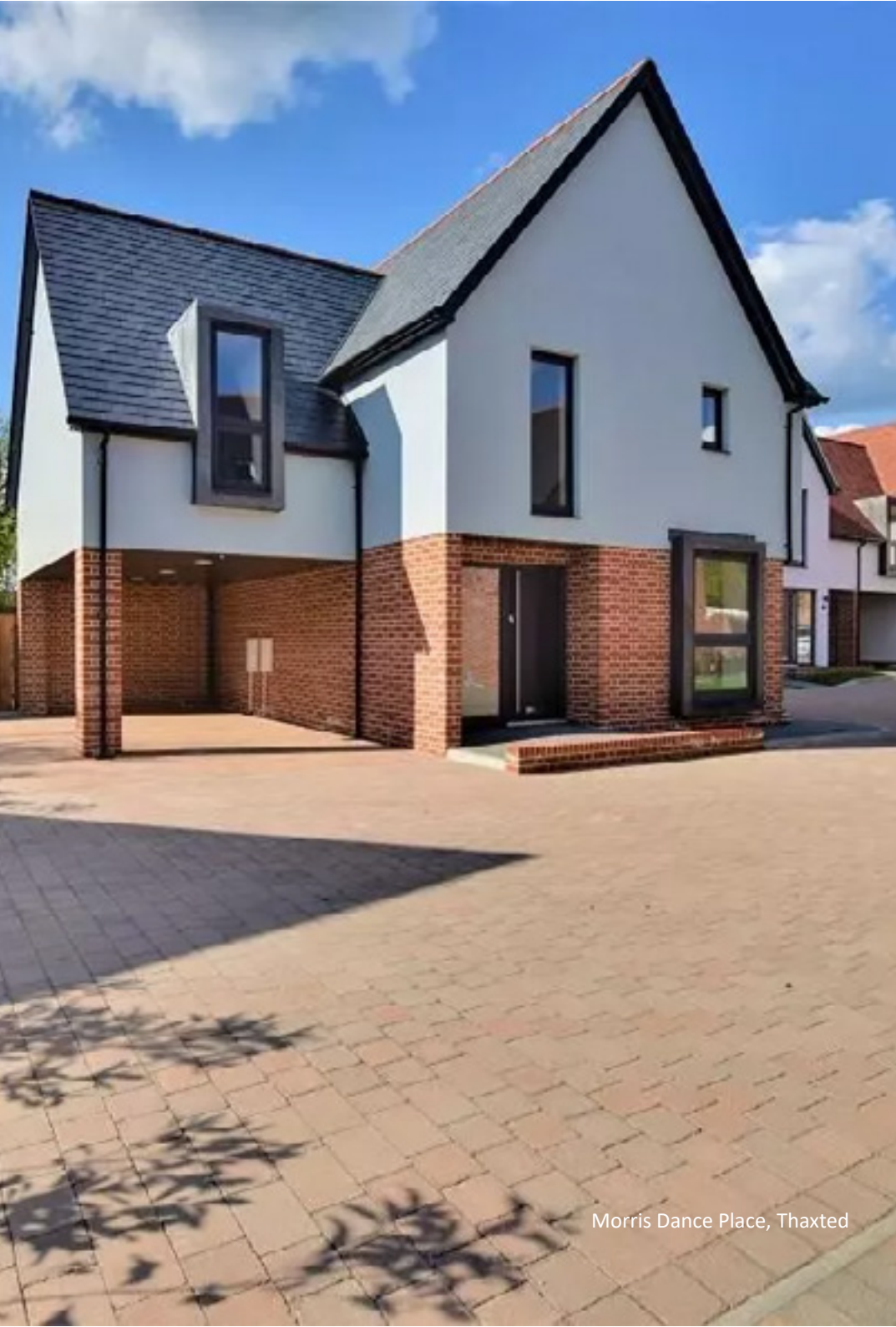
Morris Dance Place, Thaxted