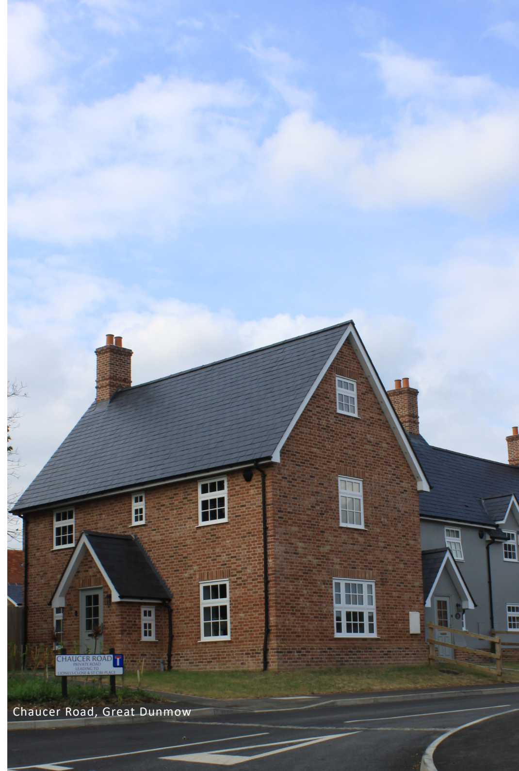
Chaucer Road, Great Dunmow

A briefing report template will be issued to the case officer via the Panel Manager or Coordinator, which will contain topic headings, such as; planning context, description of project, and stage of application. These headings will guide the officer to provide the required background information to the panel members, along with continued support from the UQRP admin team.