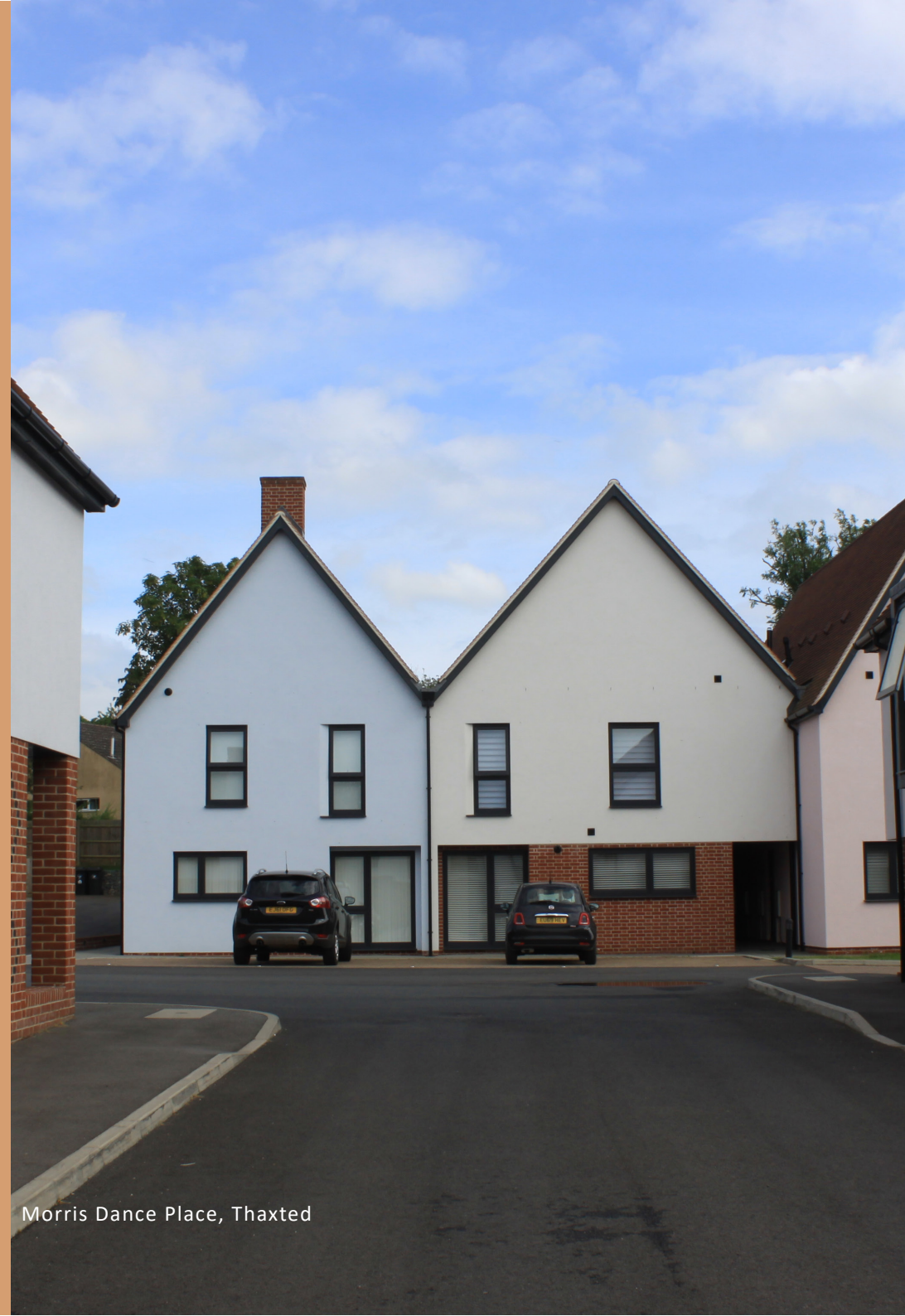
Morris Dance Place, Thaxted

During the formal review session, the LPA case officer will be asked by the Chair to provide a short presentation to further explain the planning and policy context of the project proposal, and what they will be looking for from the review. Therefore we recommend the planning officer completes a Powerpoint format proforma (example on the previous page) to allow a concise presentation with bullet points on the screen. This should take no more than 10 minutes. Following on from this, there will be a short Q+A session with the panel members to address any queries or clarifications regarding the information provided within the briefing report or case officer's presentation. The panel is open in allowing additional input for other consultees from the LPA to outline specialist concerns if required.