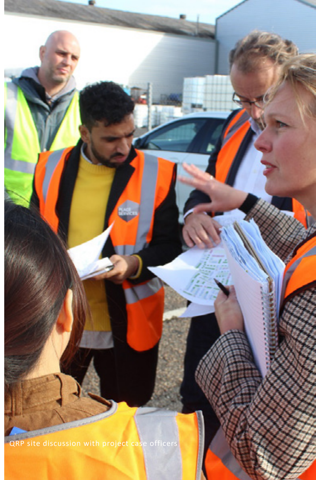
QRP site discussion with project case officers

Once a report of the session has been drafted, it will be circulated to all panel members, usually within 2 weeks after the session, for their comments by a certain date (to be detailed within email). Once comments have been collated and amended within the report, a final draft can be approved and signed off by the Chair before formal issue.