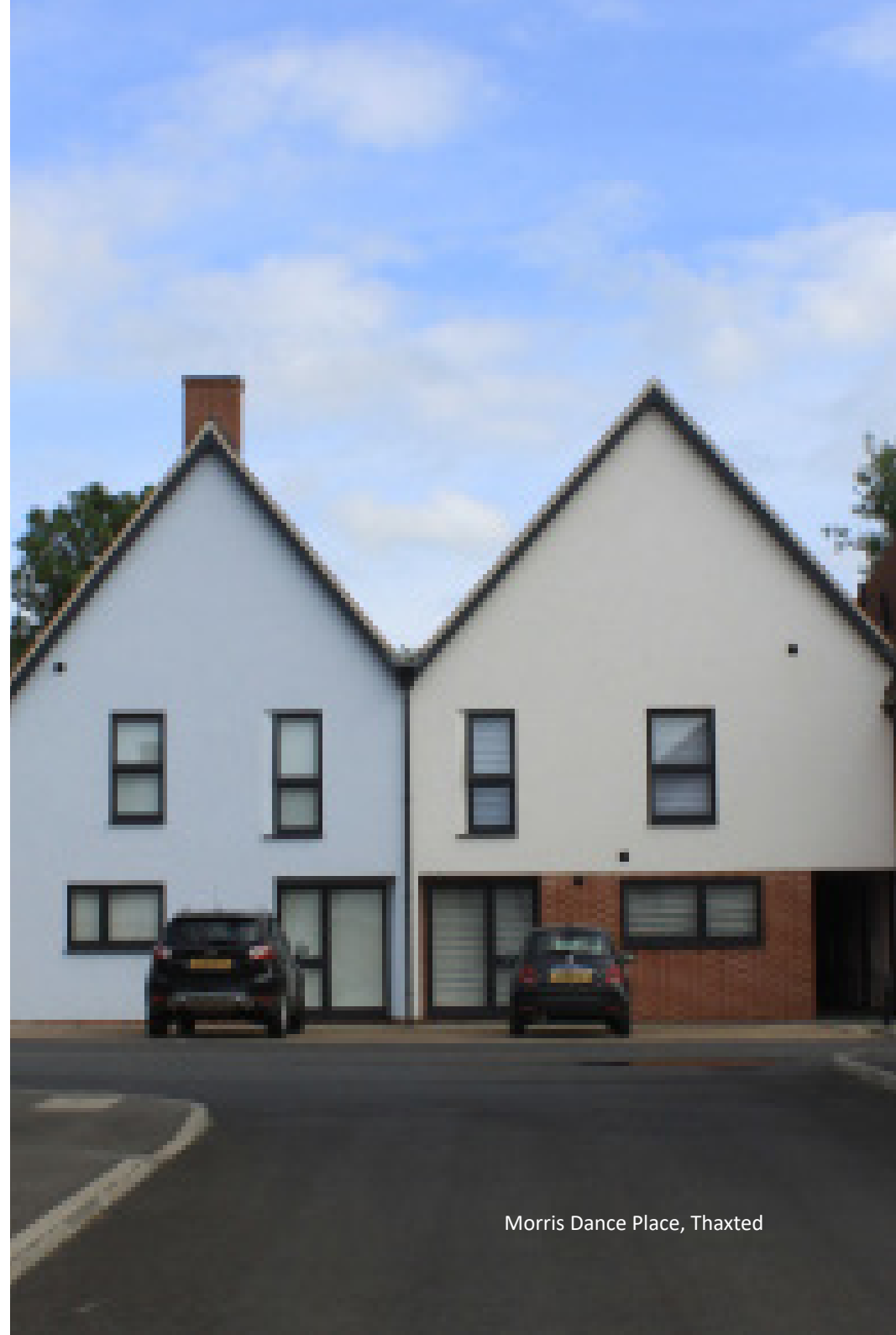
Morris Dance Place, Thaxted

At the end of the session, the Panel Manager will thank all participants and explain that Place Services will prepare the report within 15 working days using a recording of the discussion to ensure accuracy. The draft will be reviewed by panel members and the Chair before being sent to the LPA. Once the planning officer confirms the report accurately reflects the session, it will be issued to the applicant.