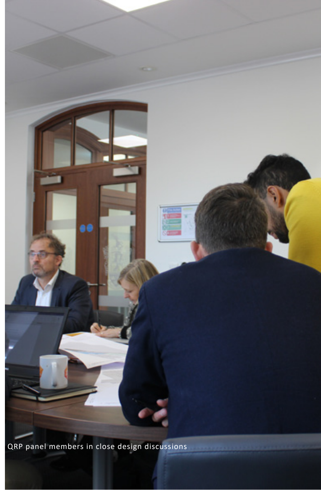
QRP panel members in close design discussions